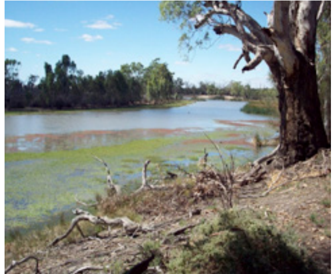
Using infrastructure to maximise ecological outcomes

With relatively modest flows to South Australia (10 – 15 000 ML/day), SARFIIP will enable floodplain inundation of the Pike and Katarapko floodplains to occur on a scale only otherwise possible under much higher flows (70 – 80 000 ML/day). These flows will help restore floodplain health, including plants and animals dependent on the wetlands and floodplains of the Riverland, while making sure salinity impacts can be managed both short and long term.