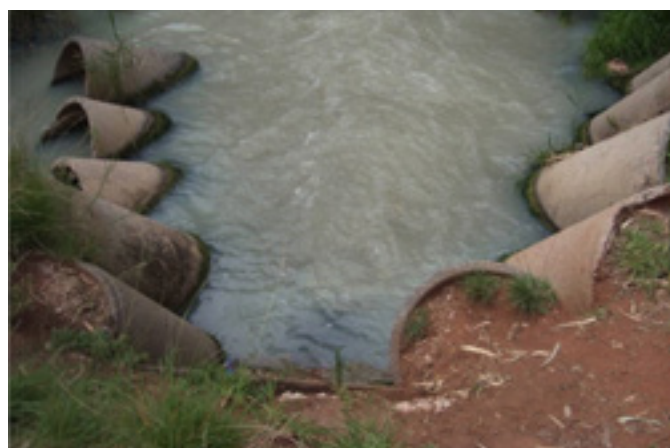
The old inlet at Margaret Dowling Creek is a barrier to fish and limits flow rates