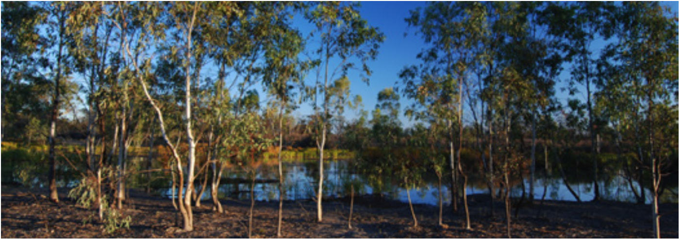
Katarapko Floodplain