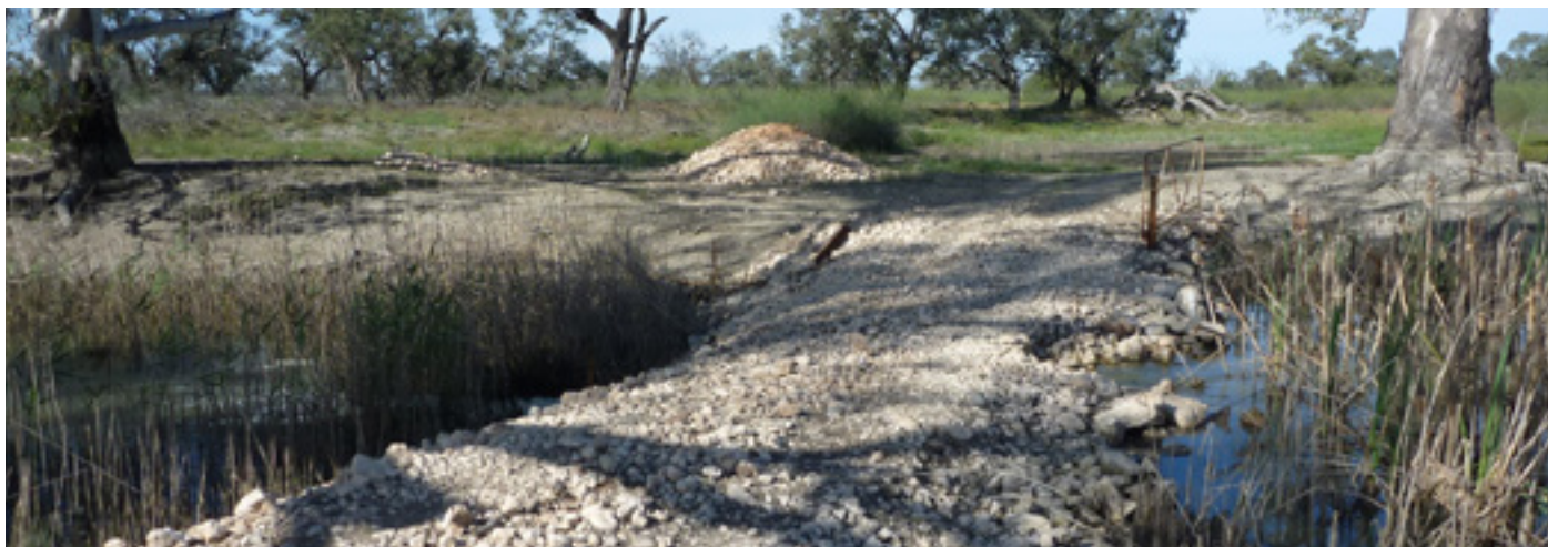
New infrastructure will restore blocked fish passage through the floodplain